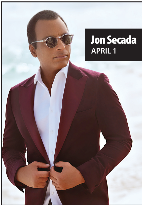
Jon Secada APRIL 1