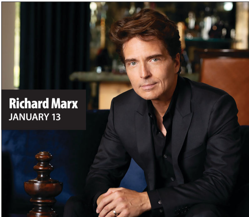
Richard Marx JANUARY 13