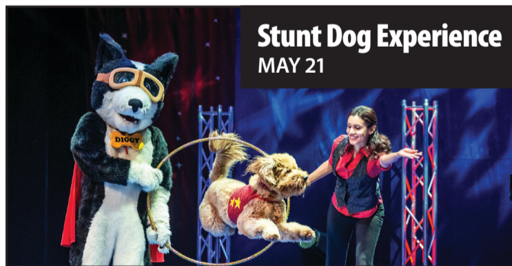
Stunt Dog Experience MAY 21