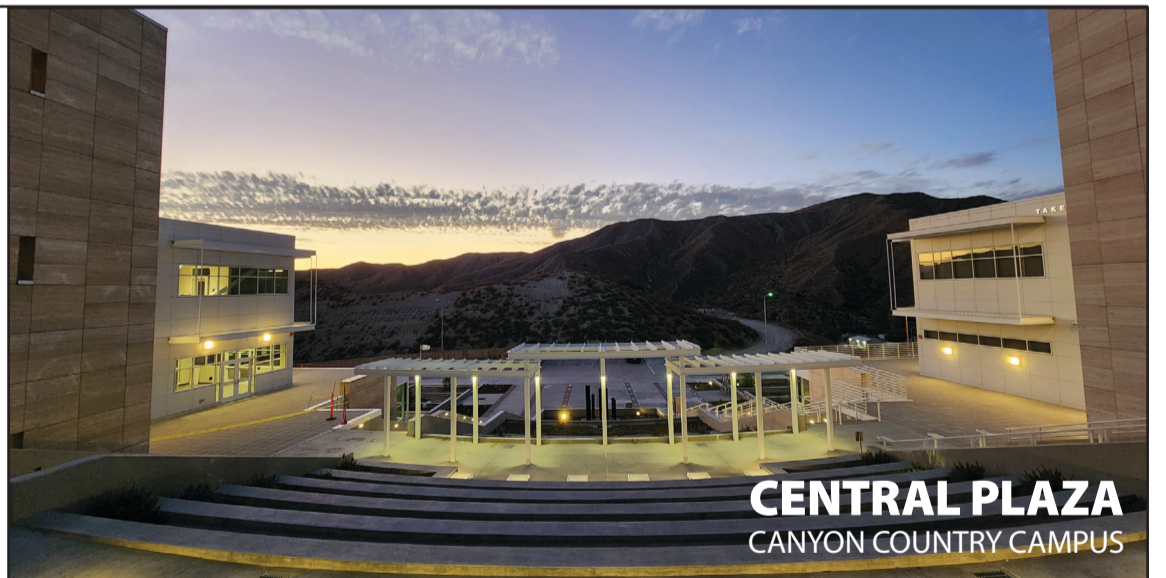
CENTRAL PLAZA CANYON COUNTRY CAMPUS

LOCATION: VALENCIA STATUS: COMPLETED 2016 MEASURE M: $2.4 MILLION