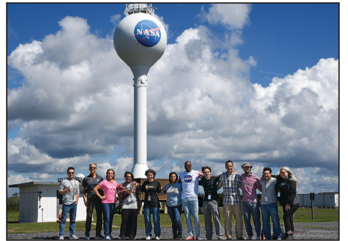
College of the Canyons team members traveled to NASA's Wallops Flight Facility in Virginia for the RockSatX launch on Aug. 11.

RockOn gives students an opportunity to work on introductory-level projects to gain experience for third-level projects. Experiments launch on a NASA sounding rocket.