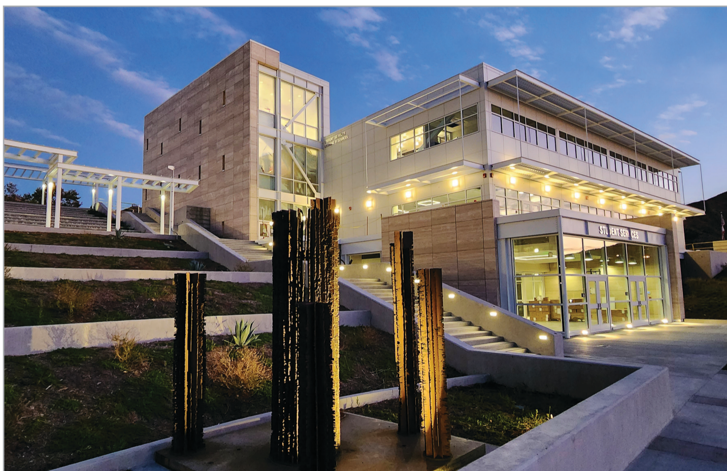
Final touches are being applied to the new Students Services/Learning Resources Center at the Canyon Country campus. With a design that mirrors the nearby Takeda Science Center, the 55,000-square-foot building is expected to be fully occupied by year's end.