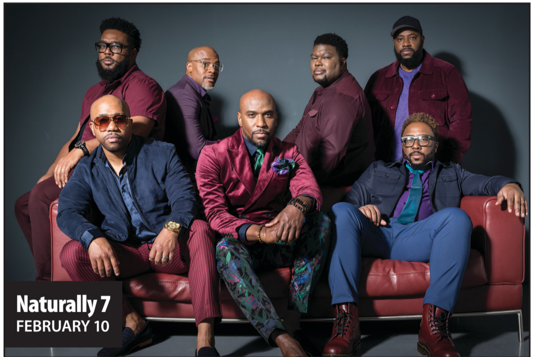
Naturally 7 FEBRUARY 10