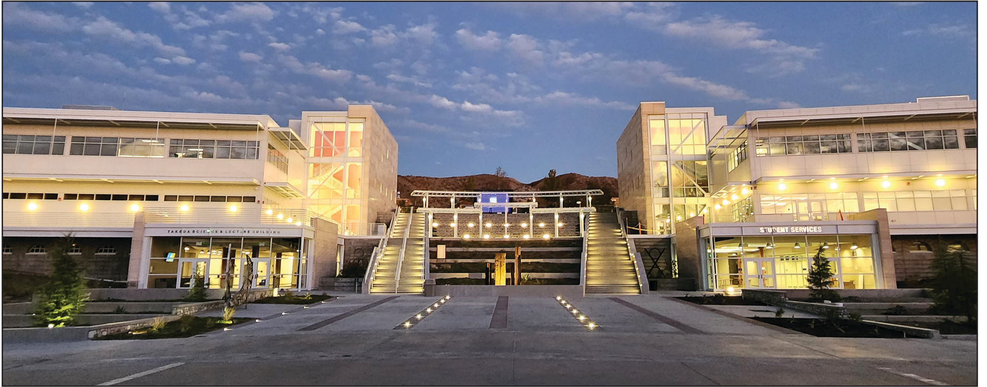
Major construction has been completed on the Student Services/Learning Resources Center (right), whose design mirrors the Takeda Science Center (left) at the Canyon Country campus.