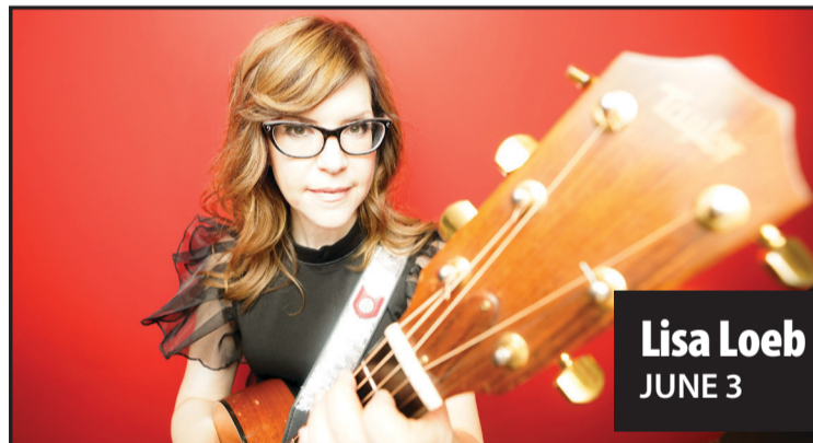
Lisa Loeb JUNE 3