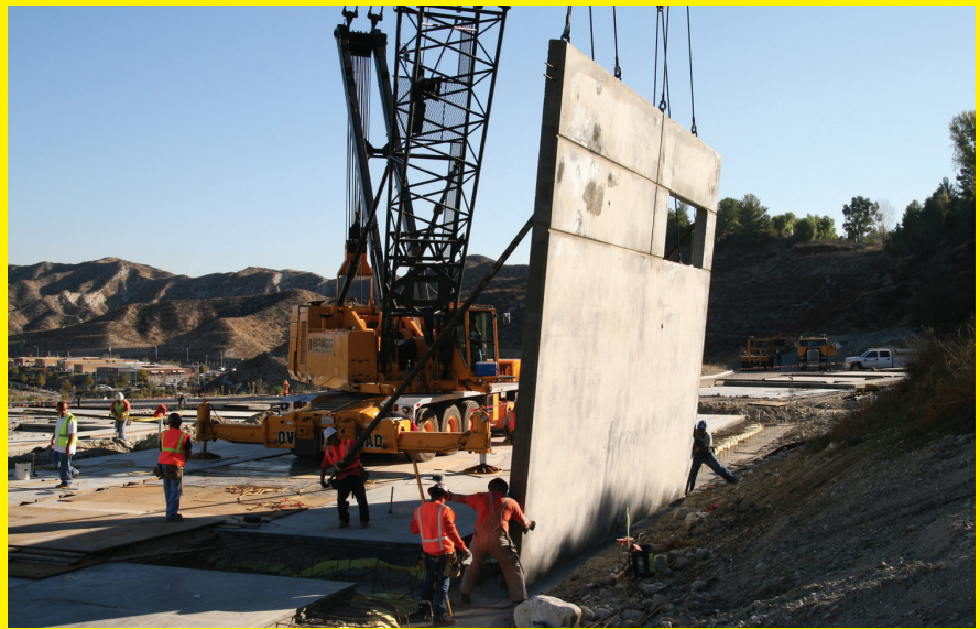
Construction crews at the College of the Canyons Canyon Country Campus help lift into place one of four concrete walls that will form the campus Applied Technology Education Center (ATEC), which went up in November. Scheduled for completion in mid-spring 2011, the ATEC will provide students with hands-on learning and training opportunities in a variety of cutting edge subject areas.

major new resource to offer students and community members upon completion of the eagerly anticipated Applied Technology Education Center (ATEC) building, which will provide students with hands-on learning and training opportunities in a variety of cutting-edge subject areas. The building’s walls were lifted into place in November, meaning completion of the campus’ first permanent building is now only a few months away.