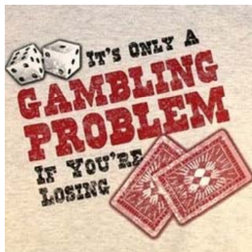
Chapters 14 and 15 – Introduction to Probability