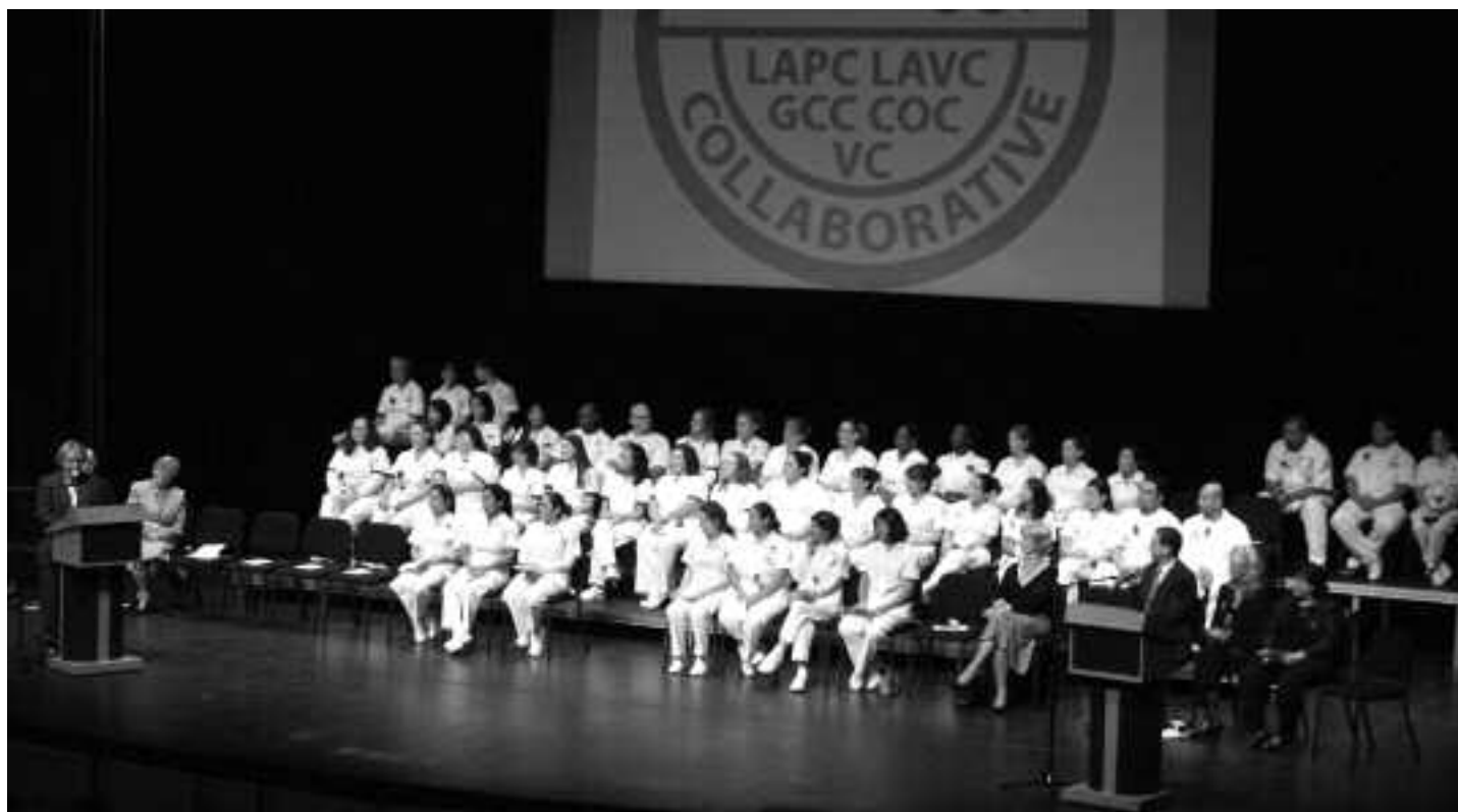
The first class produced by the regional nurse training collaborative participates in official completion ceremonies on the stage at the College of the Canyons Performing Arts Center on Dec. 15.

The Nursing Program graduated its first LVN to RN in 1980, and generic Registered Nurse education began in 1990. For more information call (661) 362-3550.