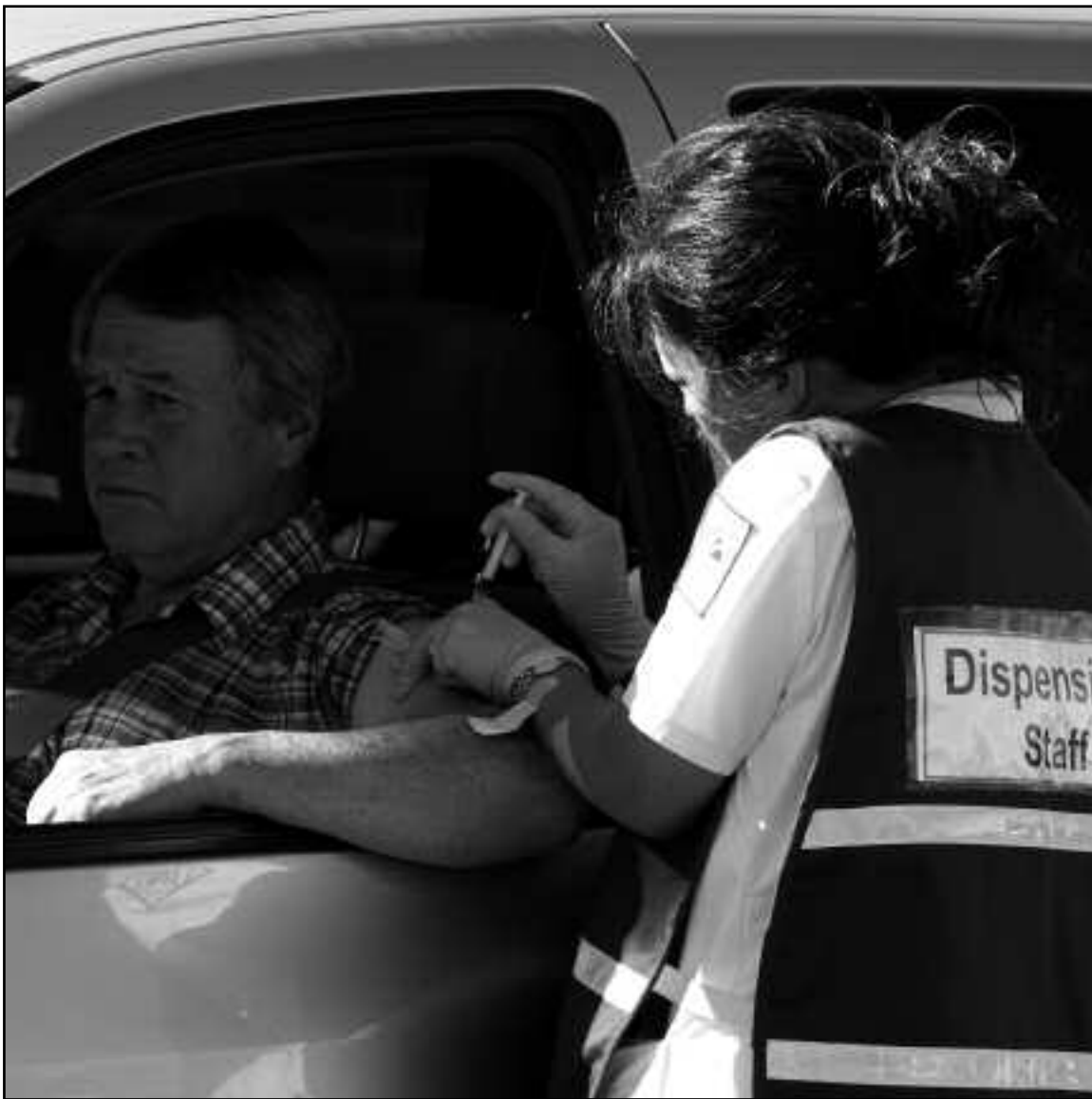
A College of the Canyons student nurse administers influenza vaccine to one of 839 people who took advantage of the college's first drive-through flu clinic. The event was held Nov. 17. See additional coverage on Page 11.