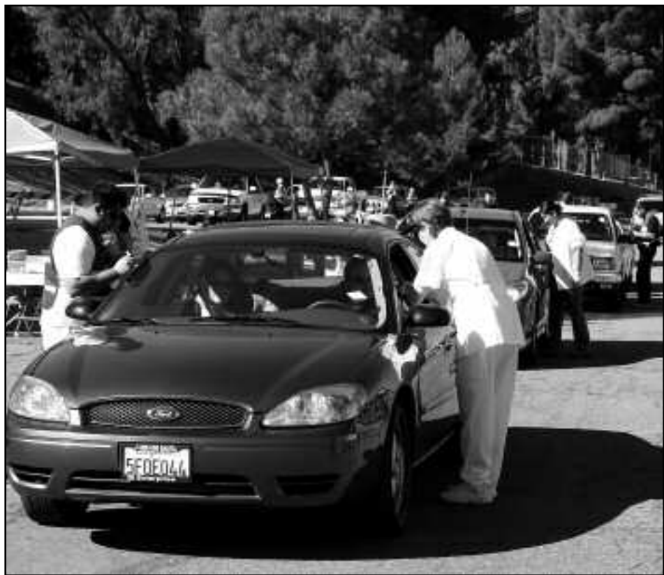
College of the Canyons nursing student volunteers administer influenza immunizations to the occupants of a line of motor vehicles during the free drive-through clinic at the college on Nov. 17.

The clinic provided excellent experience for College of the Canyons nursing students who, under the supervision of nursing instructors and County Public Health personnel, administered the shots.