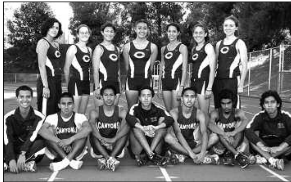
The College of the Canyons Men's and Women's Cross Country Team earned a spot at the state meet. The men finished in 16th place, while the women came in 18th.