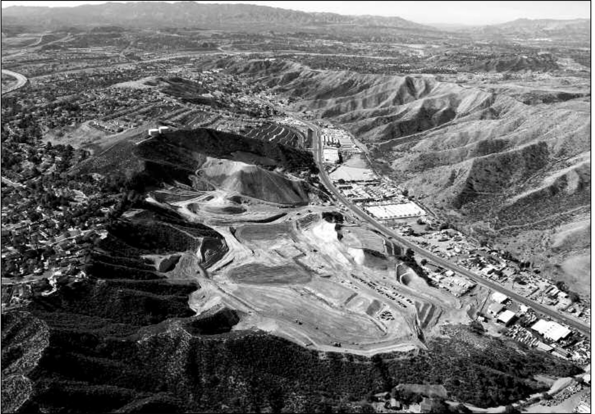
The reshaped topography for the new Canyon Country campus is evident in this January 2007 aerial photo looking southwest. Below, an architectural drawing reveals the design of the campus.