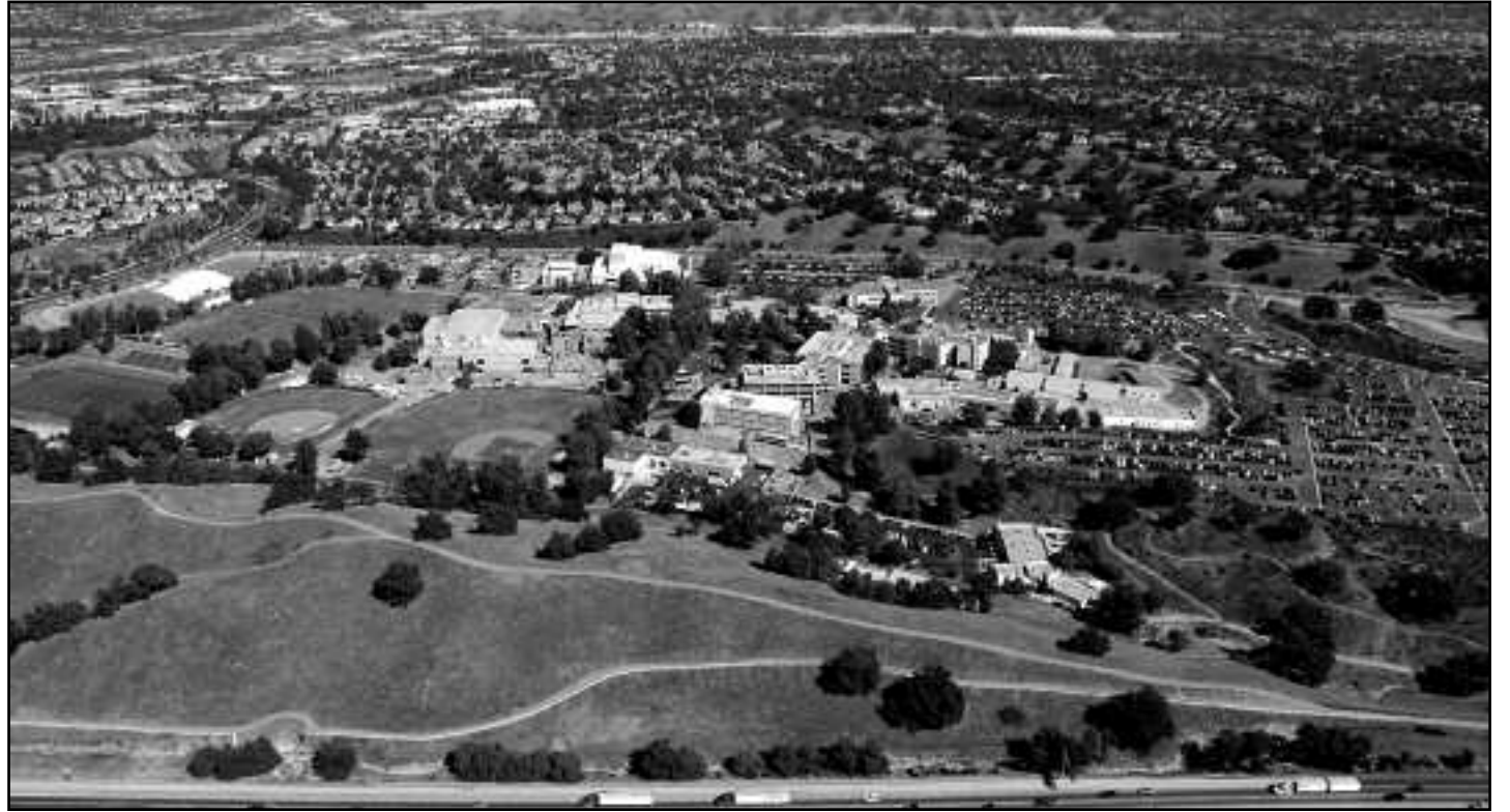
Packed parking lots and seemingly non-stop construction activity have been the norm at College of the Canyons for some time. This aerial photo, shot in December, looks east. Interstate 5 can be seen along the bottom of the image.

The growth the college is experiencing can be credited to factors such as providing students with more options, the creation of new degree programs for in-demand careers and a population surge resulting from the