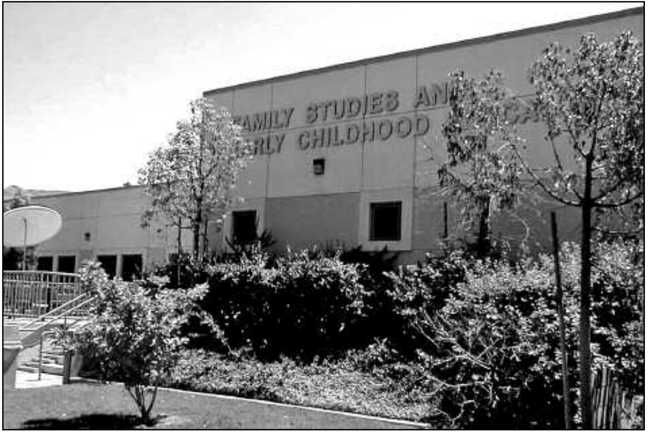
The college's Early Childhood Education Center, tucked away on the western edge of the campus, has served more than 3,000 children.

The original site of the center was the college's