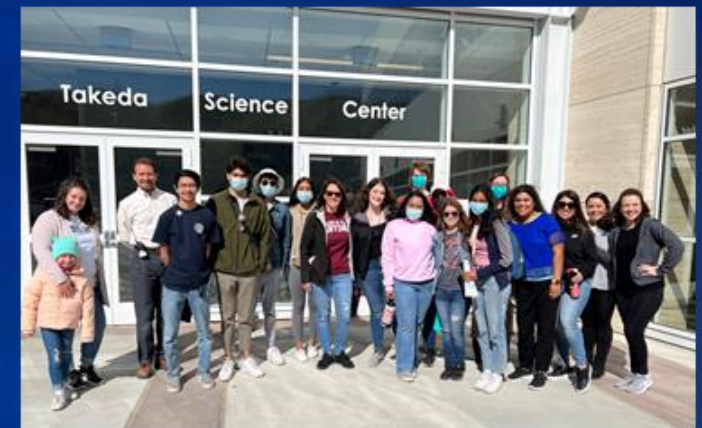
Student Outreach Event