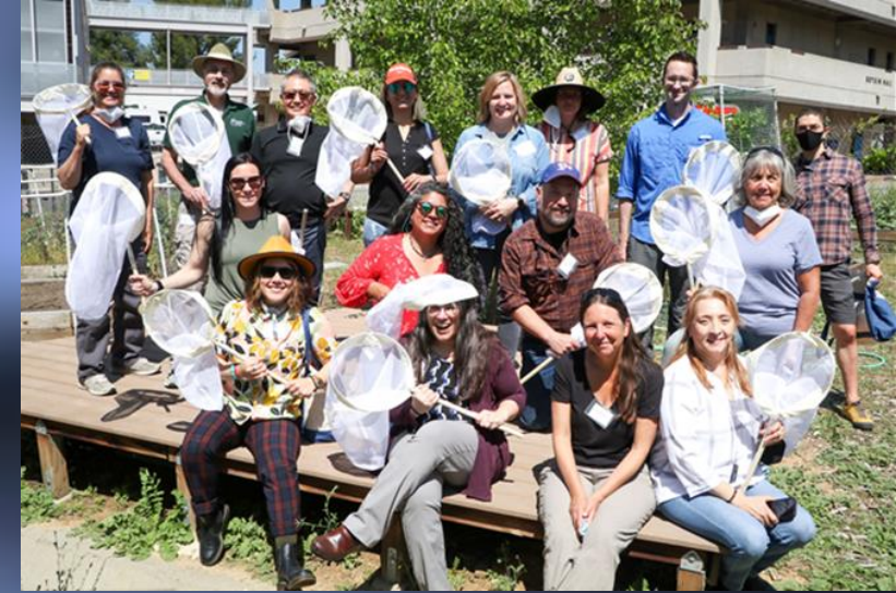
COC biology students in action supported by a NSF Biodiversity Grant