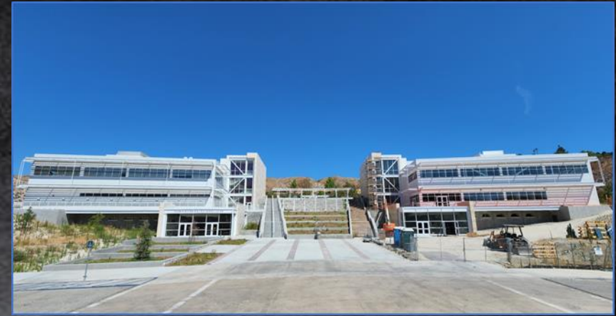
CCC Lower Plaza / Recent CalWORKs Meeting w/ Graciela Martinez