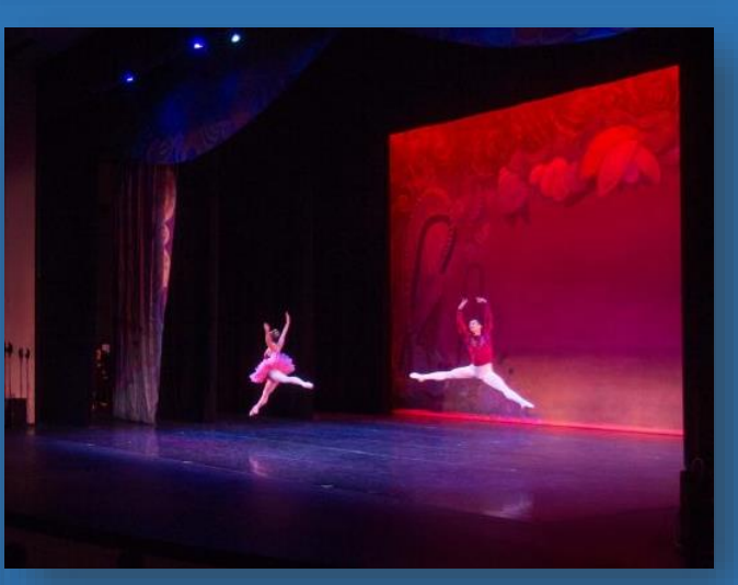
BOT Chancellor's Report