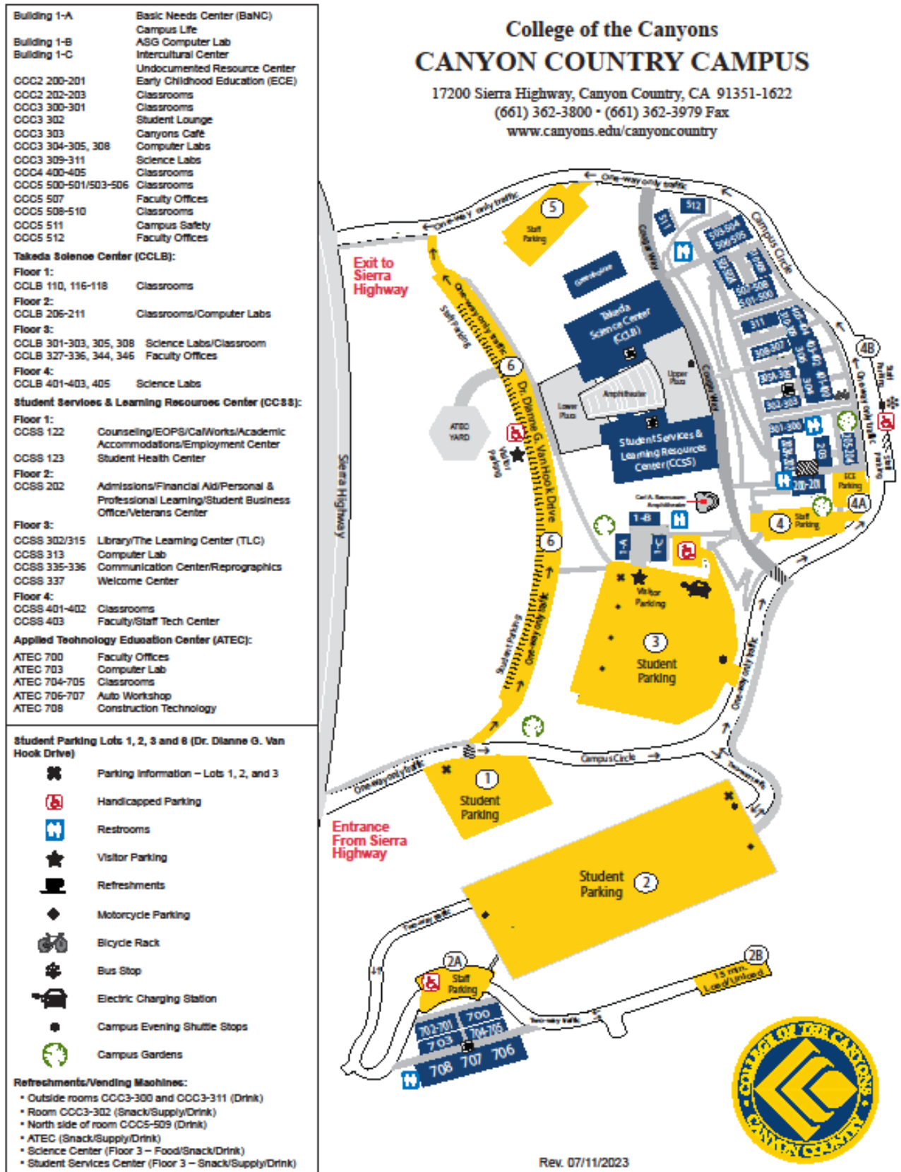
Figure 2. Canyon Country Campus Map