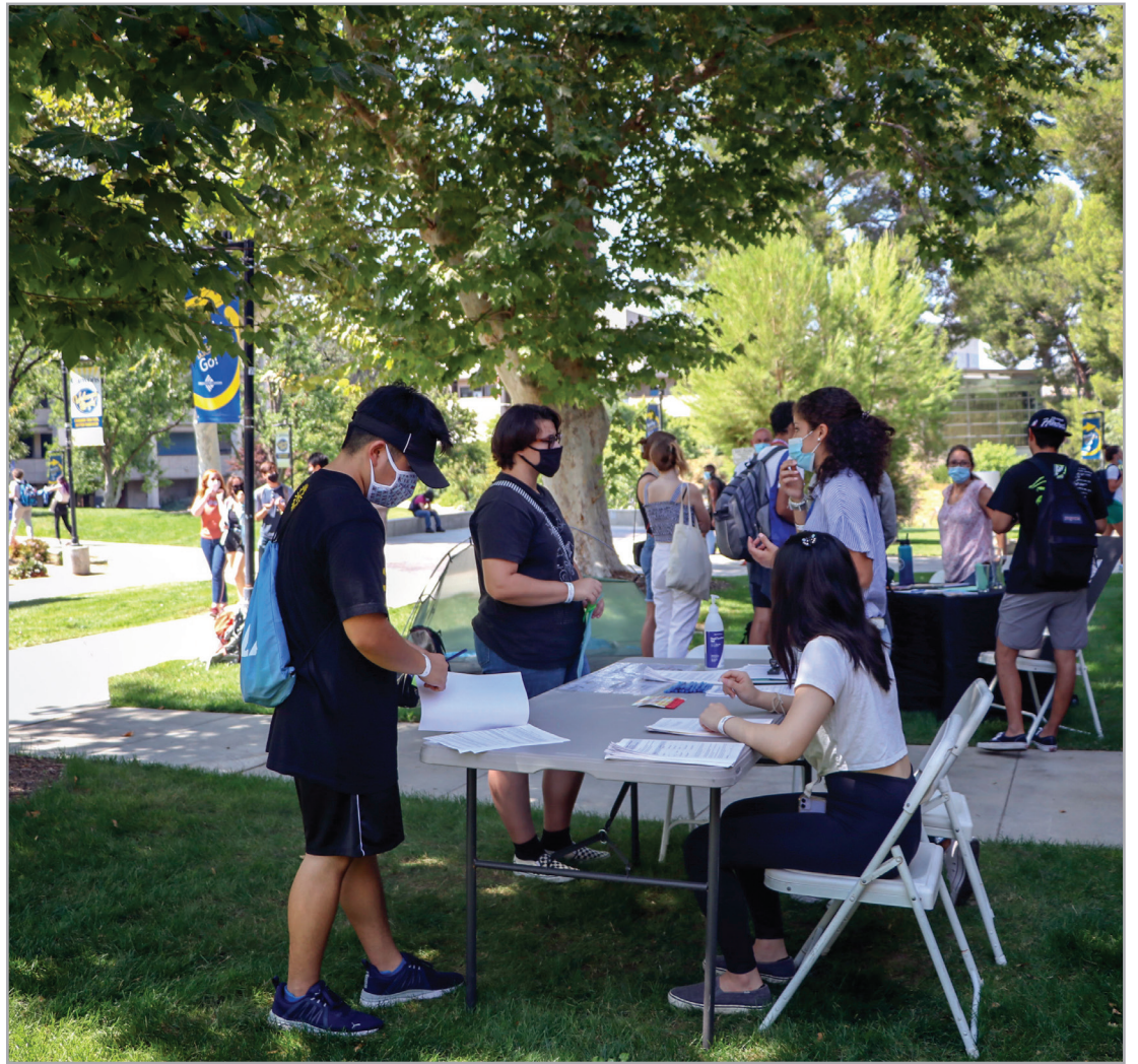
Save for the face masks, campus life is gradually transitioning to “normal.” Above, students taking classes at the Valencia campus participate in Welcome Week activities at the start of the fall semester.

The school also participates in the National Study of Learning, Voting, and Engagement, which provides colleges and universities with data on student registration and voting rates. These numbers provide benchmarks to measure the success of future voting engagement efforts.