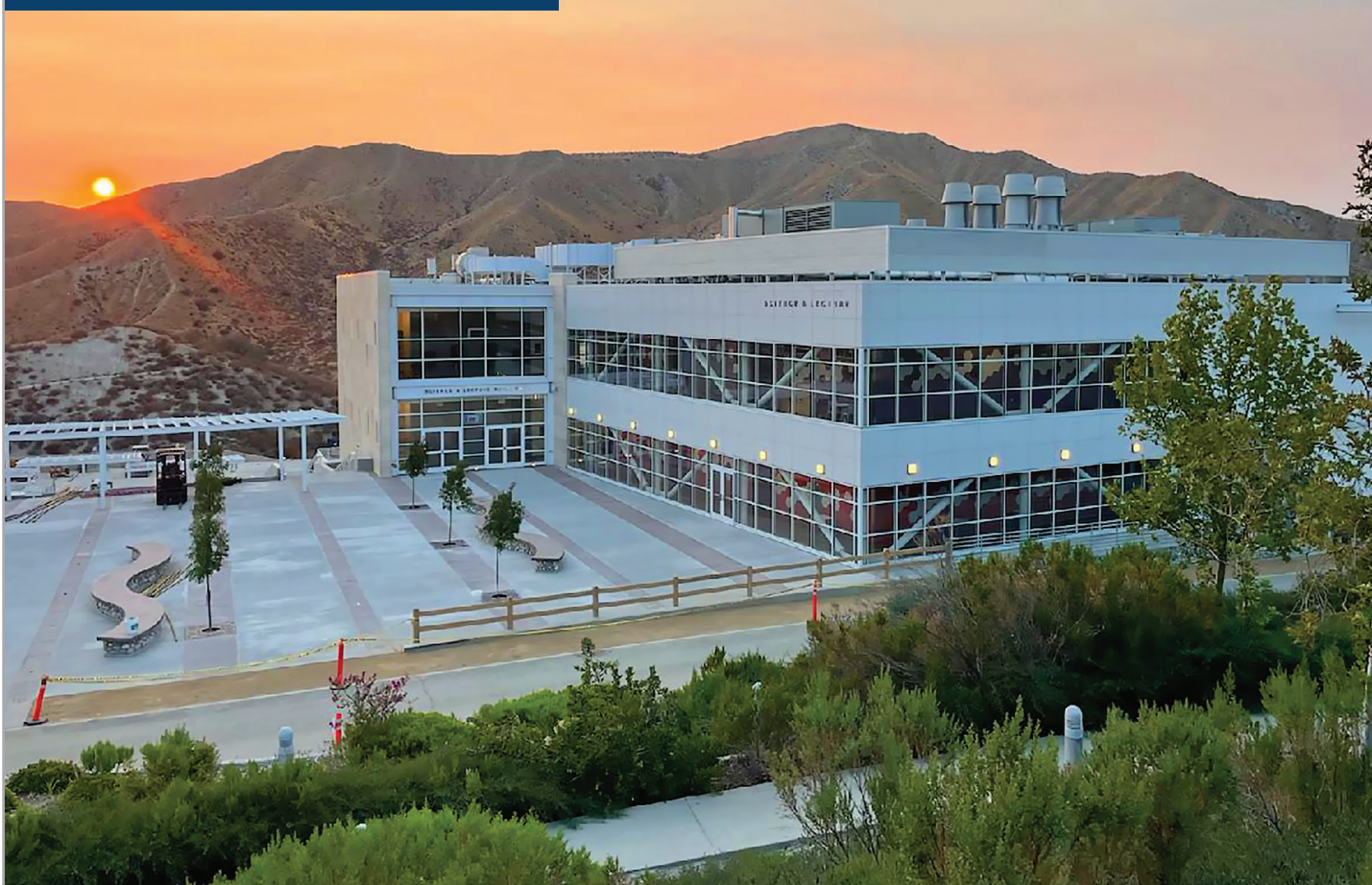
The sun descends over the much-anticipated Science Center. The 55,000-square-foot building at the Canyon Country campus opened for classes this fall.