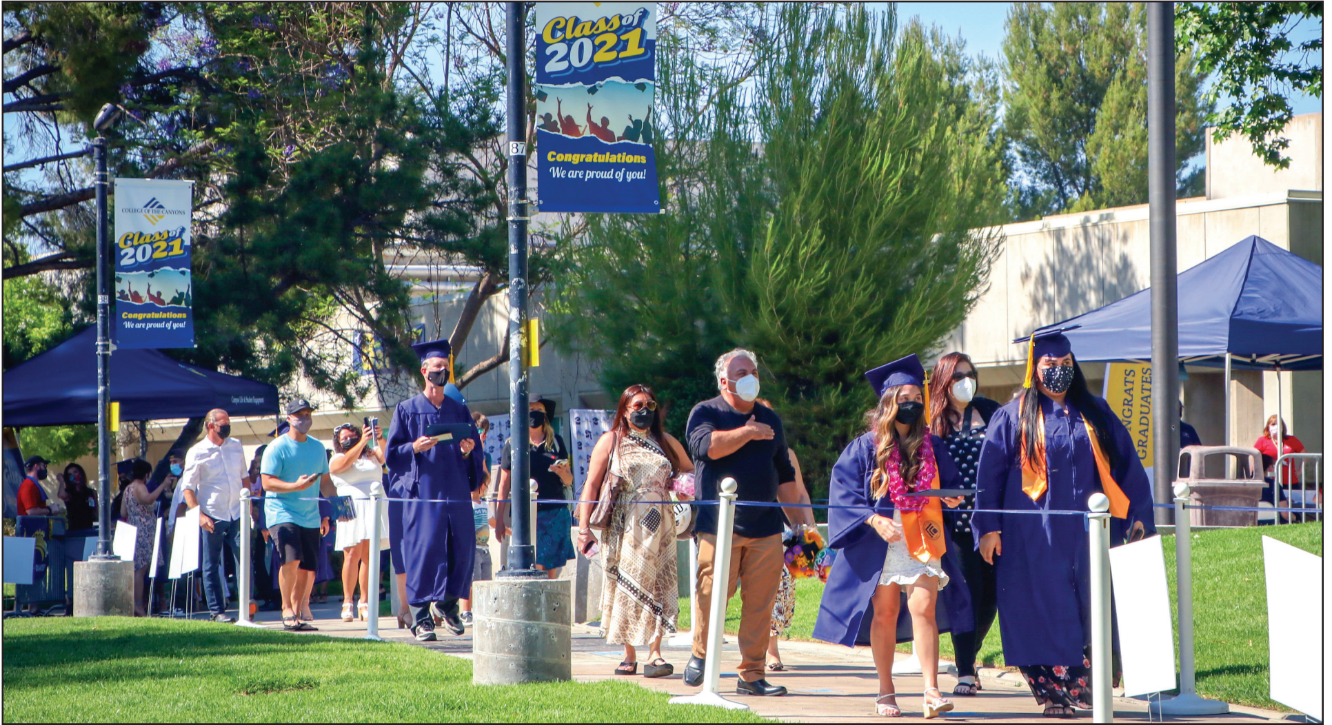
Family members and friends accompany graduates during the “Grad Walk,” which was a step closer to a traditional commencement ceremony. Last year’s ceremony was virtual.