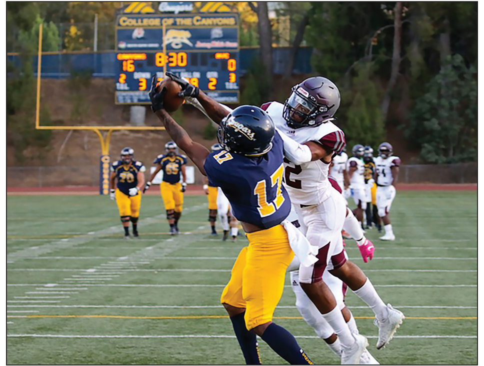
The football team, seen here in its 47-7 win over Antelope Valley College, is one of eight athletic programs competing this fall. For game schedules, please visit cocathletics.com

The college subsequently opted out of participating in shortened fall/winter and spring 2020-21 sports seasons that would have occurred during the spring 2021 semester.