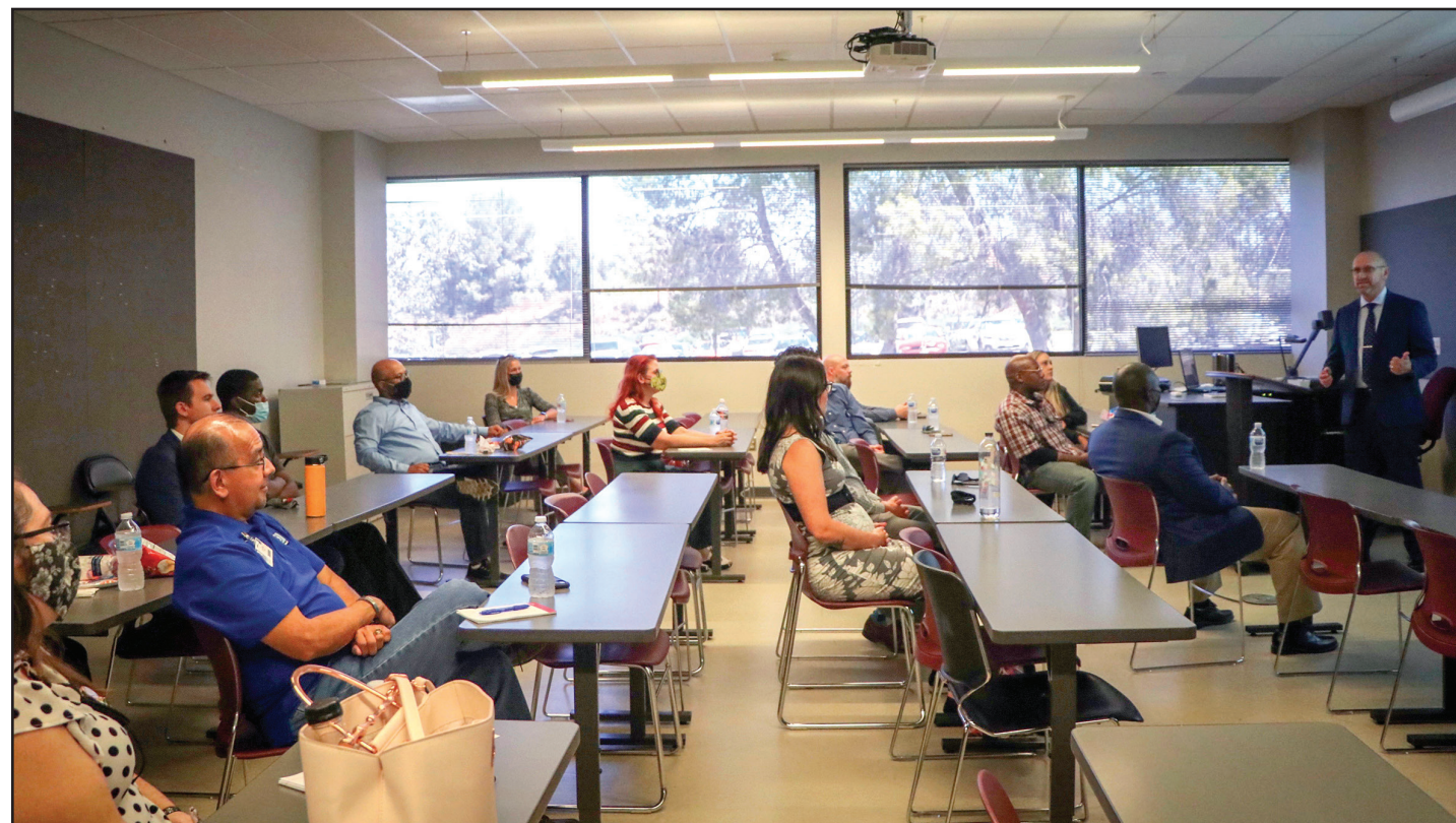
Community members attend an information session for the Low-Observable Coatings Application Program.

The S-STEM program’s mission is to enable talented, low-income students to pursue successful careers in promising STEM fields.