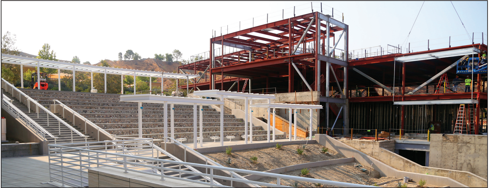
Construction has begun on the Student Services/Learning Resources Center, whose design will mirror the now-completed Science Center at the Canyon Country campus.