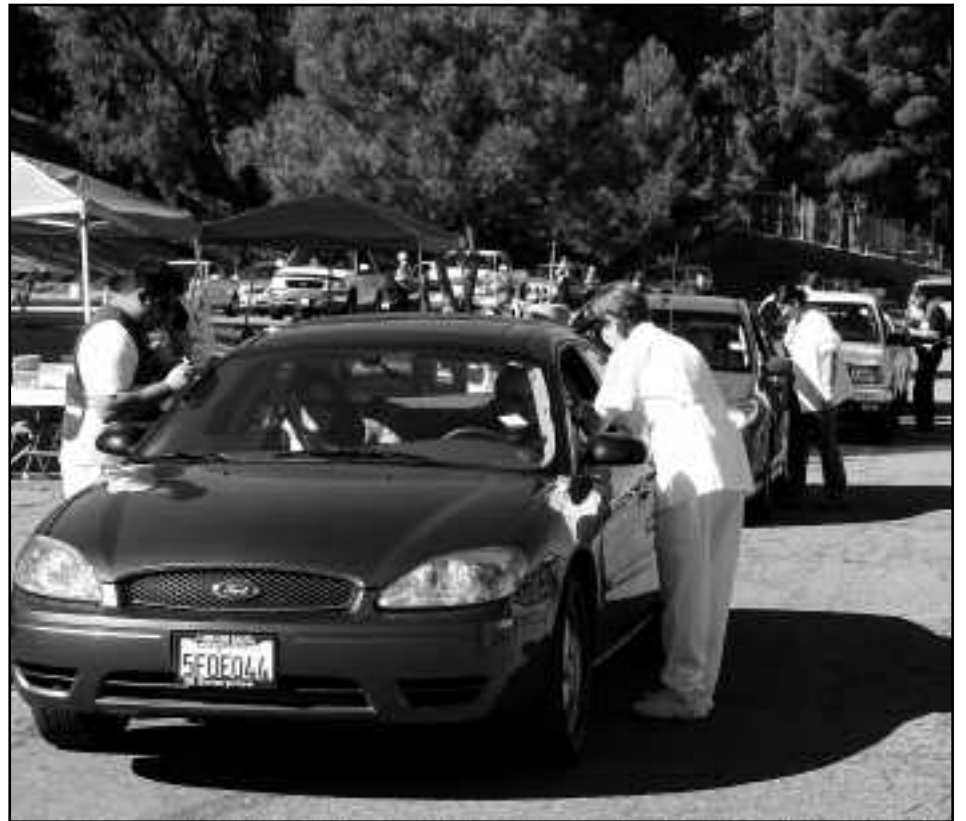
College of the Canyons nursing student volunteers administer influenza immunizations to the occupants of a line of motor vehicles during the free drive-through clinic at the college on Nov. 17.

The clinic provided excellent experience for College of the Canyons nursing students who, under the supervision of nursing instructors and County Public Health personnel, administered the shots.