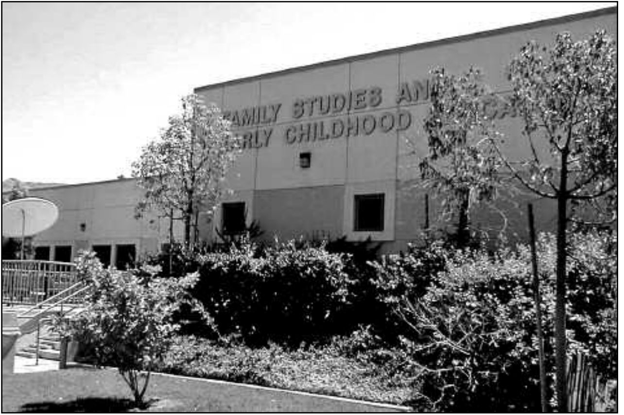
The college’s Early Childhood Education Center, tucked away on the western edge of the campus, has served more than 3,000 children.

The original site of the center was the college’s