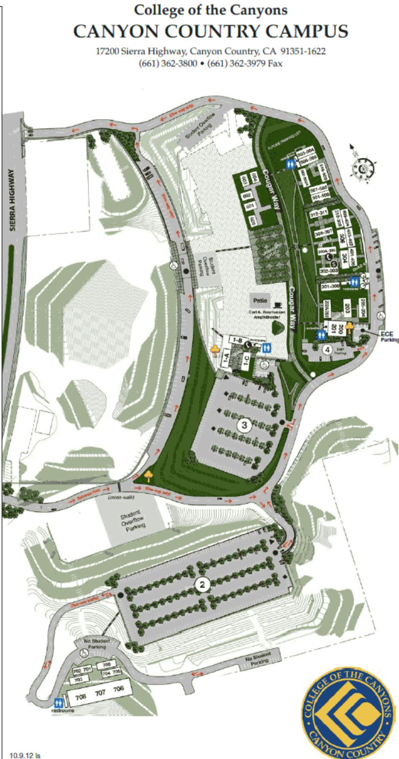
Figure 2. Canyon Country Campus Map