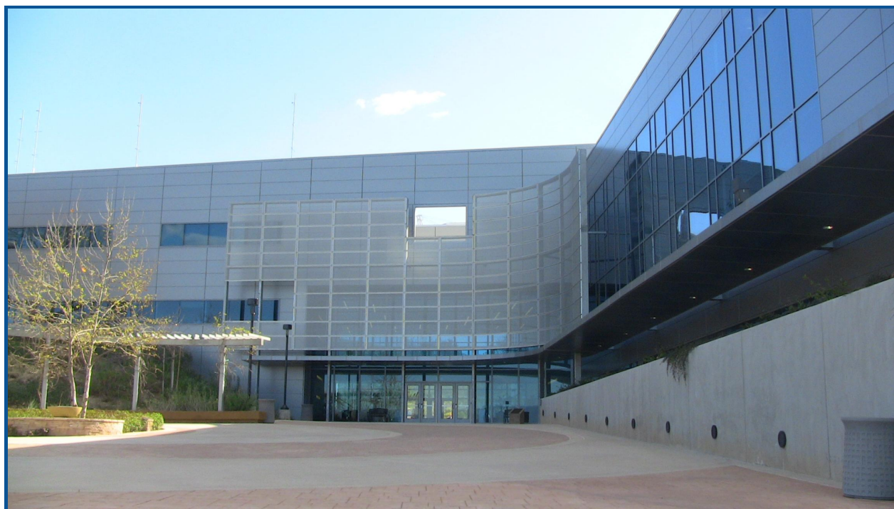
University Center Entrance