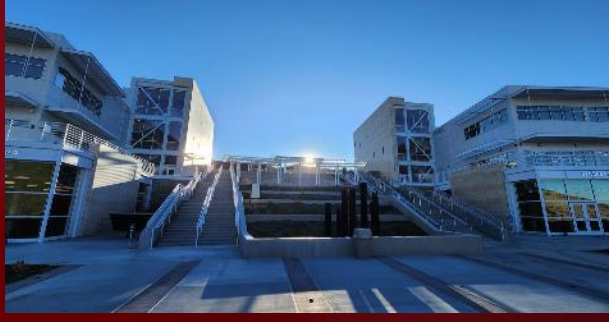
New Facilities at CCC