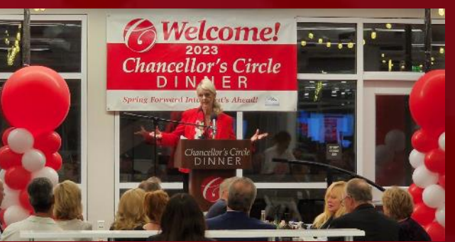
Chancellor's Circle Dinner