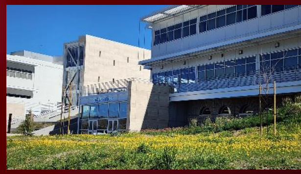
Glimpse of Early Spring