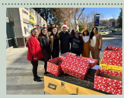
Classified Staff delivering Holiday Candy Grams!