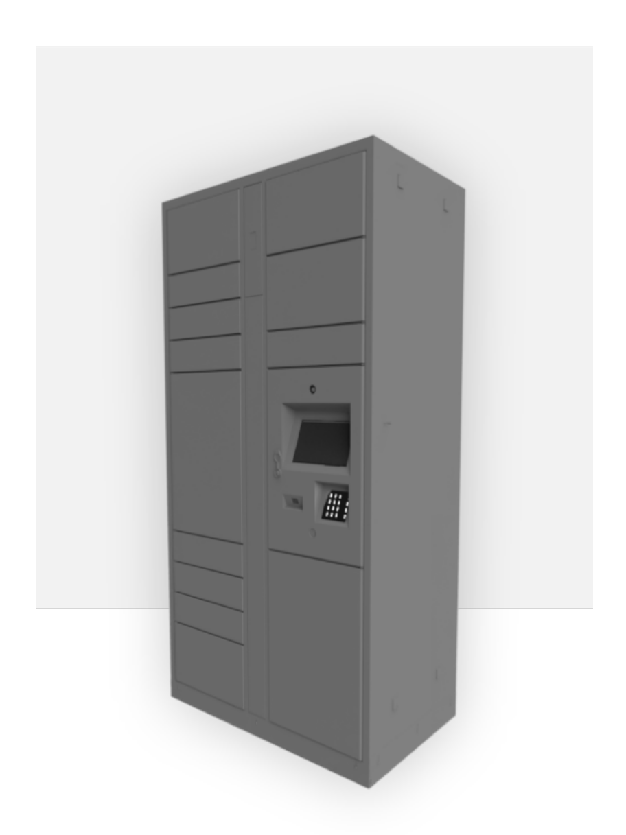
Appendix A1: Standard Locker Hub with Accessible Touch Screen and Keypad

This is an image of the standard indoor parcel locker from Parcel Pending by Quadient. It features 13 versatile locker spaces and an ADA-compliant accessible keypad for package retrieval.