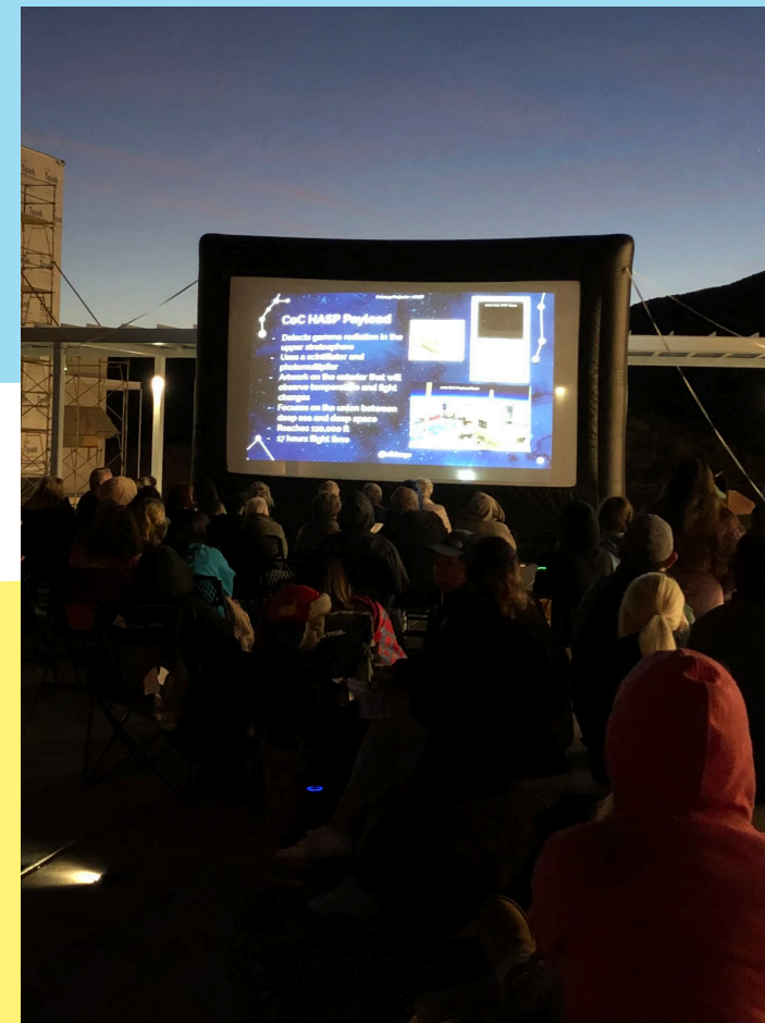
Photo from the Mars Exploration presentation that discussed a specific payload mission