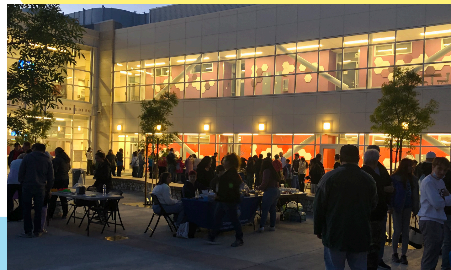
Some of the attendees, clubs, and booths present at the Star party