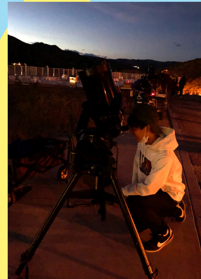
Student viewing a telescope