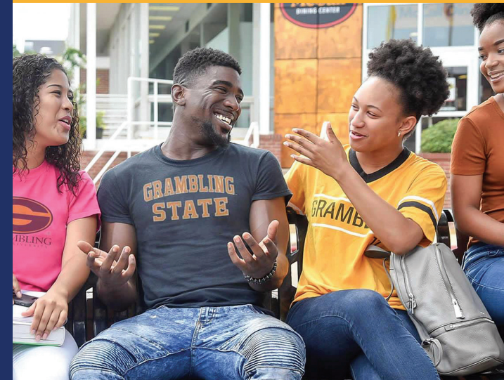
GRAMBLING STATE UNIVERSITY